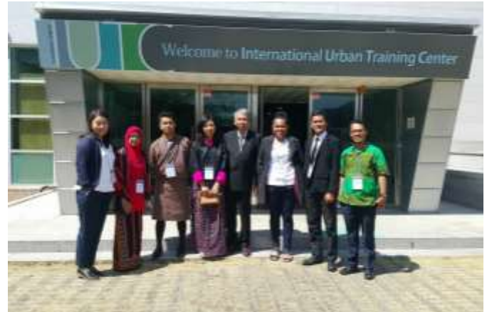
Participants from Mongolia, Indonesia, Bhutan and Solomon Island meeting on the first day of the training course.

Housing affordability is one of the greatest challenges faced by governments. The lack of affordable housing in cities is closely associated with the multiplication and persistence of slums and informal settlements, poor infrastructure, overcrowding, land and housing speculation and distress living conditions. Resolving accessibility to housing will immediately spin off to urban vitality and improvements in the quality of life in cities. The provision of affordable housing is a human rights matter that has been underscored internationally by more than 170 nations when reaffirming